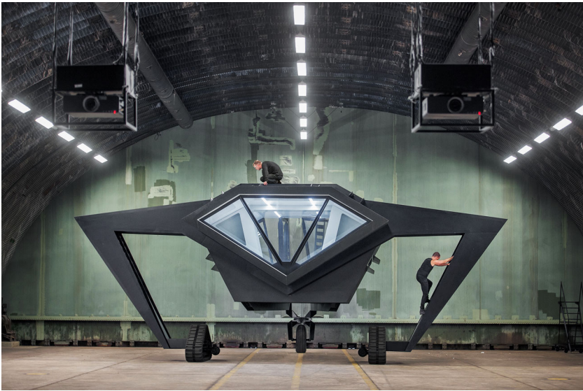
Fig. 3 Press photo of Secret Operation 610 by Raymond Rutting for Volkskrant newspaper