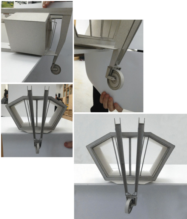
Fig. 2 Photos of rear of model with wheel and window frame, made to be send to spatially distant collaborator FH

FH may be physically absent at that moment and at other times throughout their collaboration, yet at the same time and in various ways, he still takes part in the design practices in which AM and RR engage themselves. They mutually inform each other about their contacts with FH, which frequently take place at FH's studio, on site in Soesterberg and on the phone, and then, typically, discuss FH's feedback and contributions. While working, sketching and drawing together they also often emphasize, through FH or from his perspective, particular points that require special attention, for instance when RR says about a design idea: "This FH would never think up", (smilingly) utters when making an adjustment: "FH will not agree with this one", or while working together with AM on a small particular part of the design notes that for FH it is all about sturdiness: "FH always emphasizes the strength and probably won't mind so much what this detail looks like. But that's a good thing, this way we keep each other sharp".